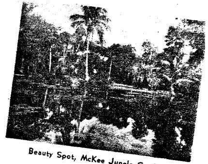
Beauty Spot, McKee Jungle Gardens