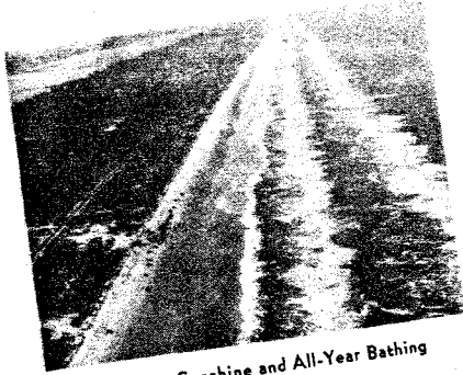
Enjoying Sunshine and All-Year Bathing